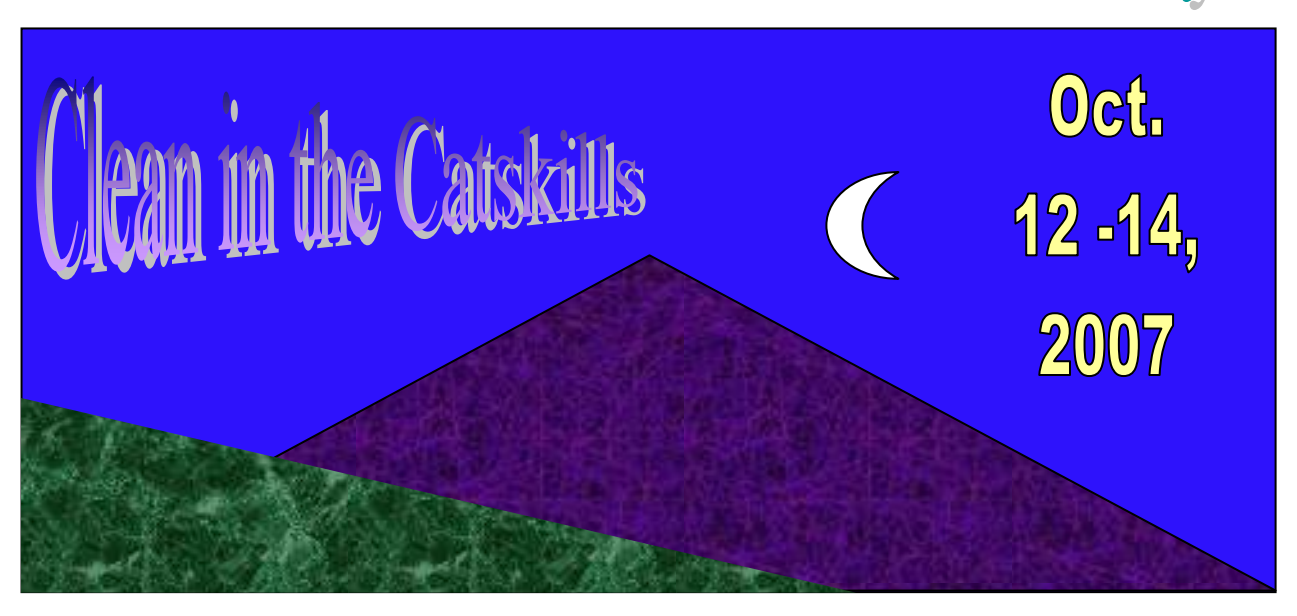
This year's theme is "Promises on our Steps to Recovery"